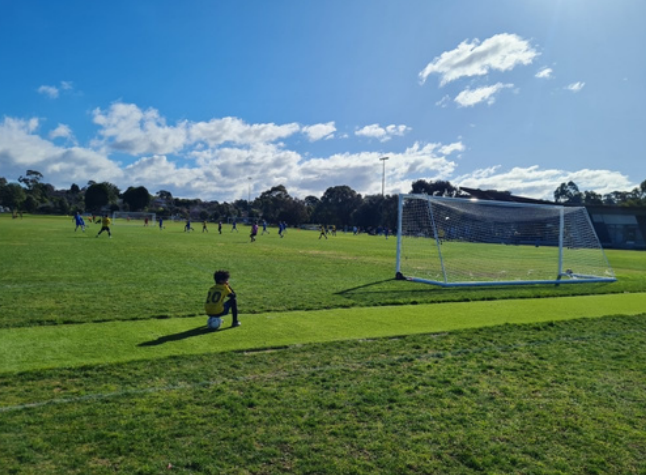
Waiting for the day to become a senior player!